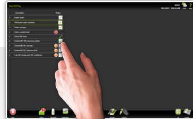
Start of the day